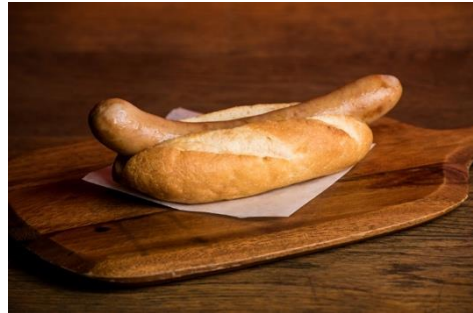
*yelo CAFE Hot Dog

The 1 st floor Atrium will feature a café and merchandise shop that all guests can enjoy. Visitors without tickets to any of the games in the building will also be able to indulge in the Atrium's shops.