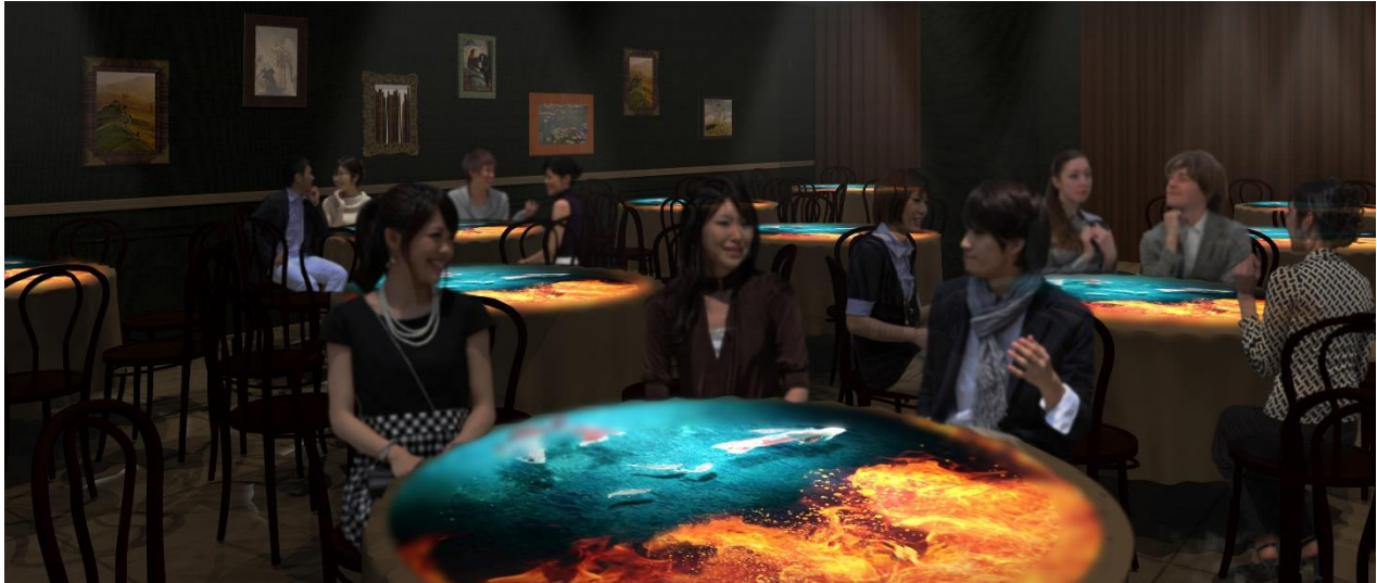
*4 th floor, PTG – Spellbound Supper area image

The Projection Table Game, “Spellbound Supper”, utilizes digital art technology where participants solve puzzles that are projected onto their table. With every correct answer or action made, the images and sounds change like magic into a new puzzle.