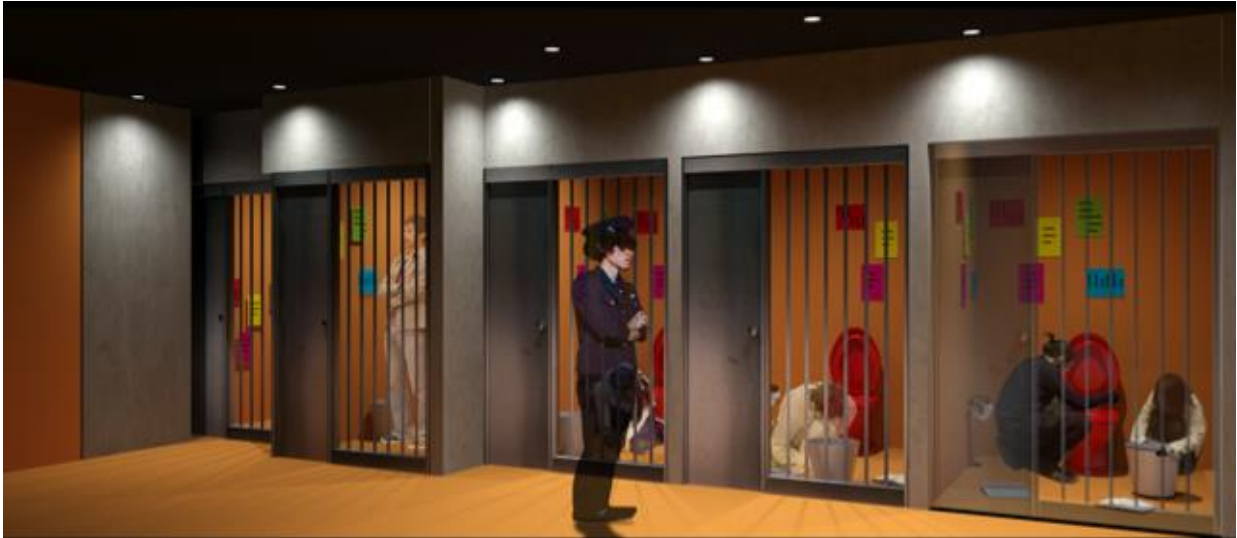
*2 nd floor, Escape from The Prison area image

"Escape from The Prison" is a brand-new type of Real Escape Game that lets you experience an entire game in just 10 minutes. It was created as a shortened version of the Real Escape Game for players who are not familiar with the concept of escape games and are hesitant to commit to a 30-to-60-minute game. Players must solve the locks and codes in the prison, and escape their prison cell before their execution the next day!