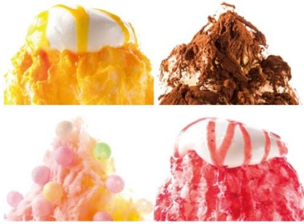
*yelo CAFE Shaved Ice