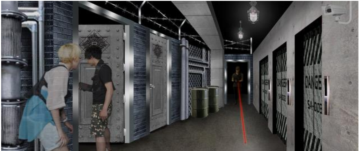
*3rd floor, THE SECRET AGENT area image